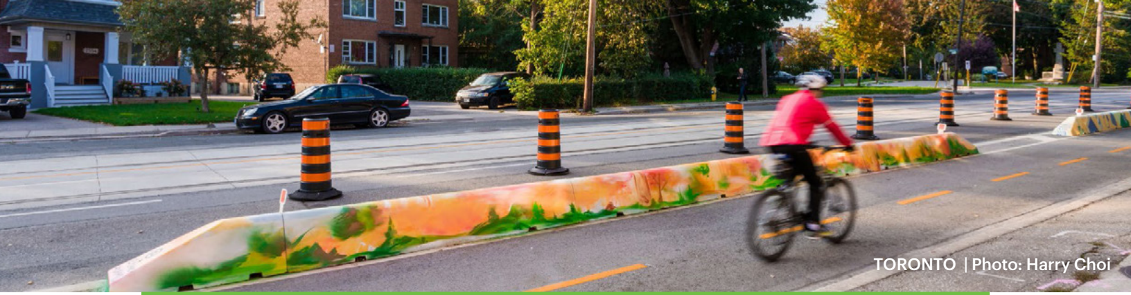
TORONTO | Photo: Harry Choi