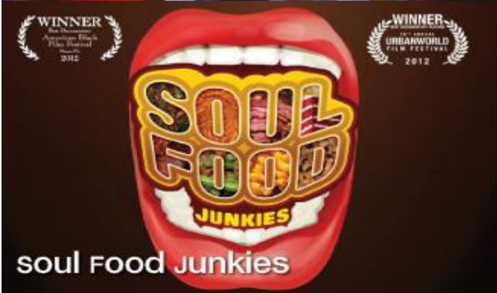
soul Food Junkies