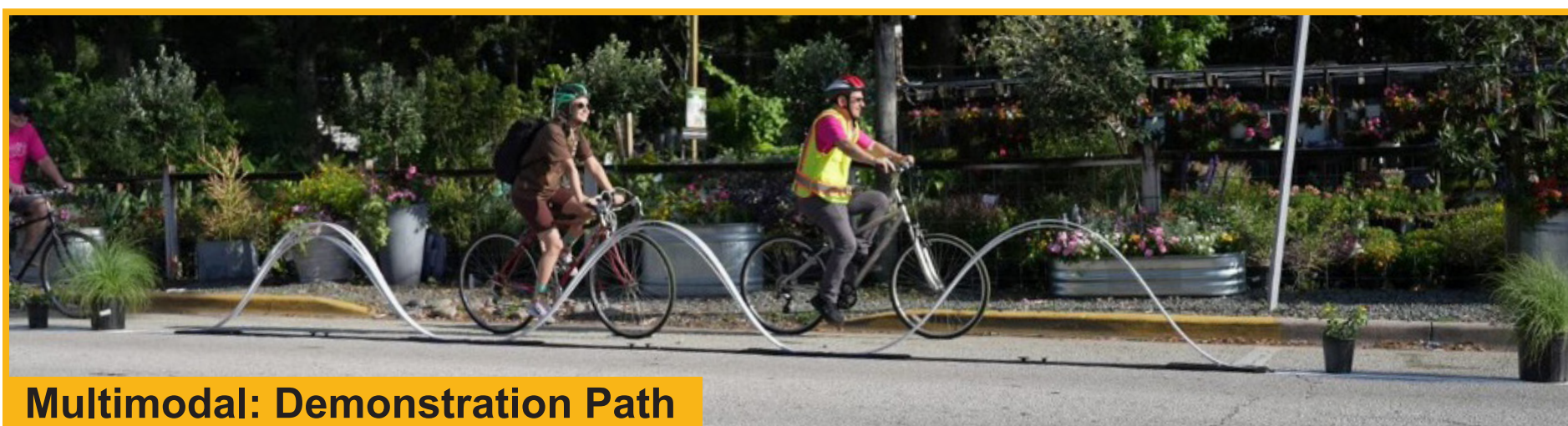
Multimodal: Demonstration Path

The journey is the destination. Through on-the-ground experience, literature review, peer city interviews, and internal stakeholder workshoping – we were able to create a guide that is informed by best practices and cutting edge, but fits the unique structure and process of the City Beautiful.