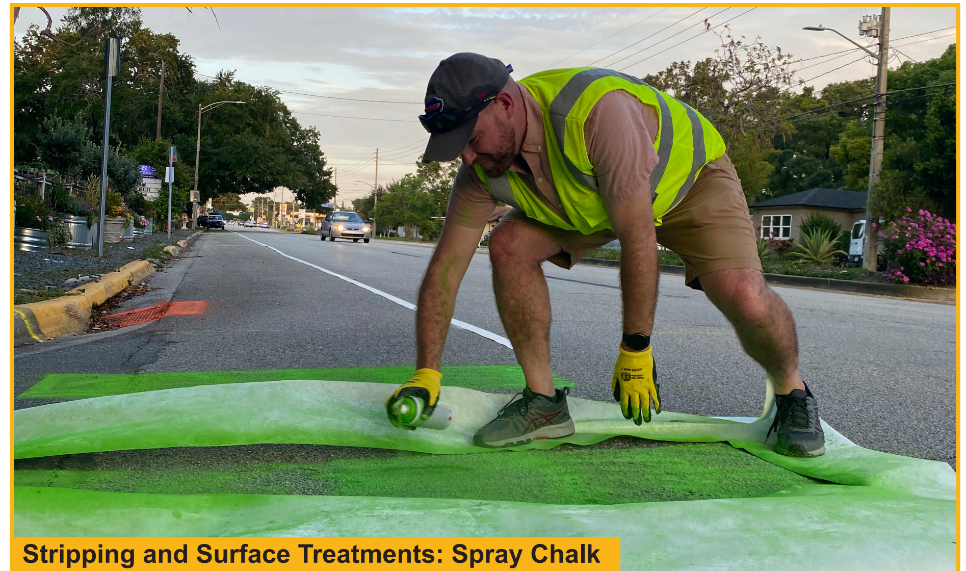
Striping and Surface Treatments: Spray Chalk