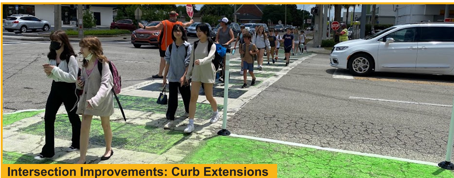
Intersection Improvements: Curb Extensions