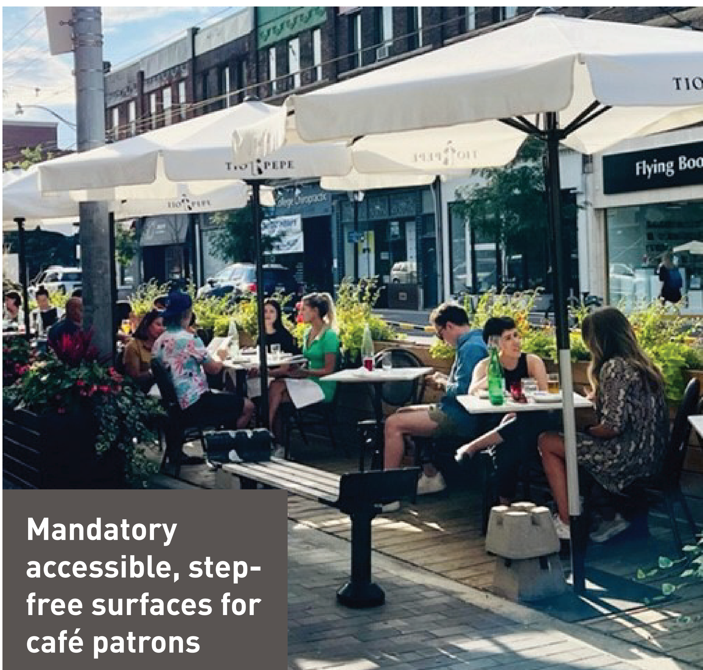
Mandatory accessible, step-free surfaces for café patrons

Toronto's First Protected Intersection: After the construction of Toronto's first protected intersection, staff organized two accessibility-focused site visits with people with disabilities. Participants provided insight on the effectiveness and perceived safety of the infrastructure for people with mobility challenges.