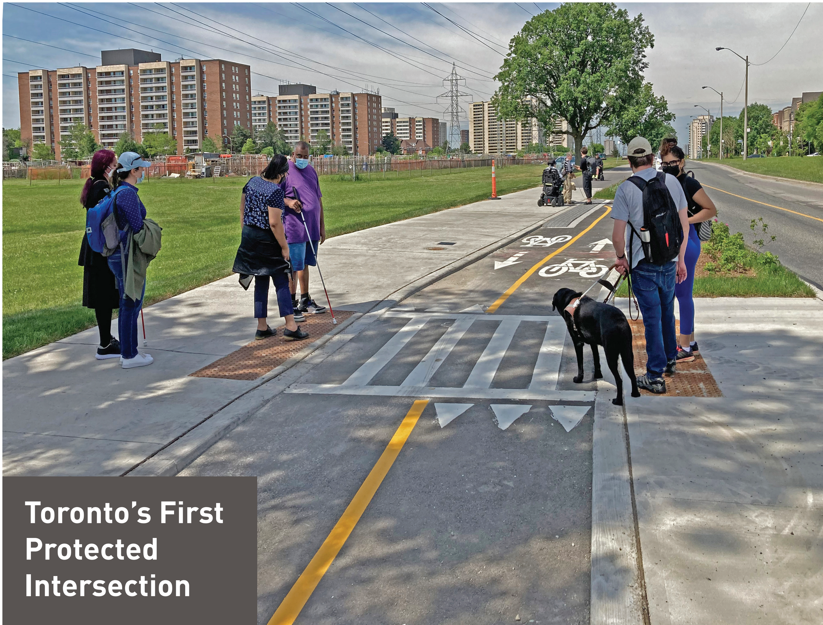
Toronto's First Protected Intersection

The City of Toronto's Transportation Services Division is committed to ensuring safe and accessible mobility options for people of all ages and abilities. Streets, sidewalks, work zones and curbside patios are being addressed through new standards, programs and capital project delivery, in consultation with people with lived experience.