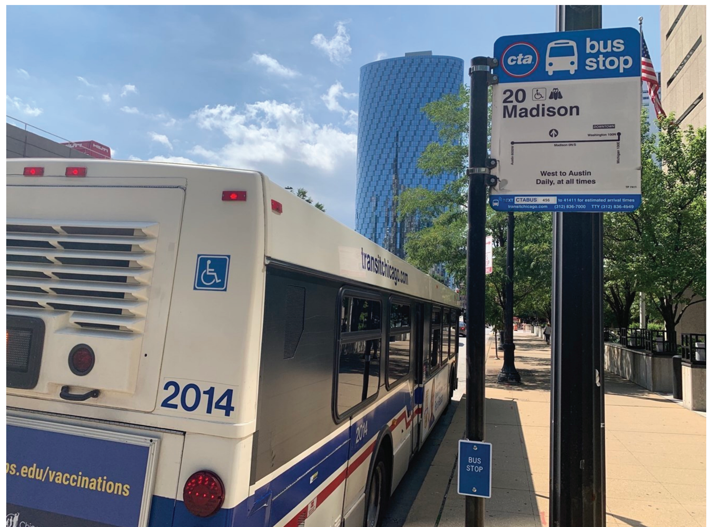
Photo of Tactile Sign at Bus Stop