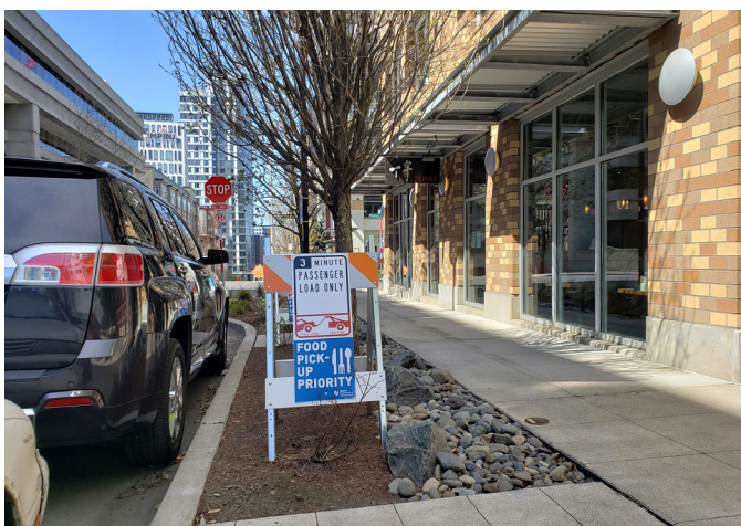
Seattle, WA, USA