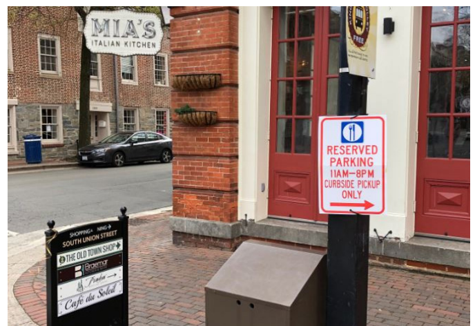
Alexandria, VA, USA

Seattle introduced a program to convert parking spaces near food establishments into pick-up and loading zones for customers and delivery workers.