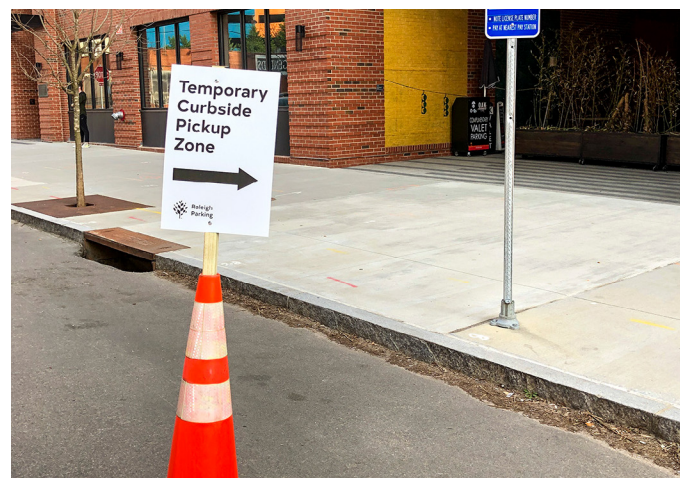
Raleigh, NC, USA