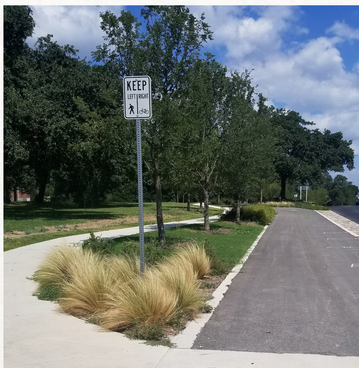
MED CENTER GREEN STREET PROJECT