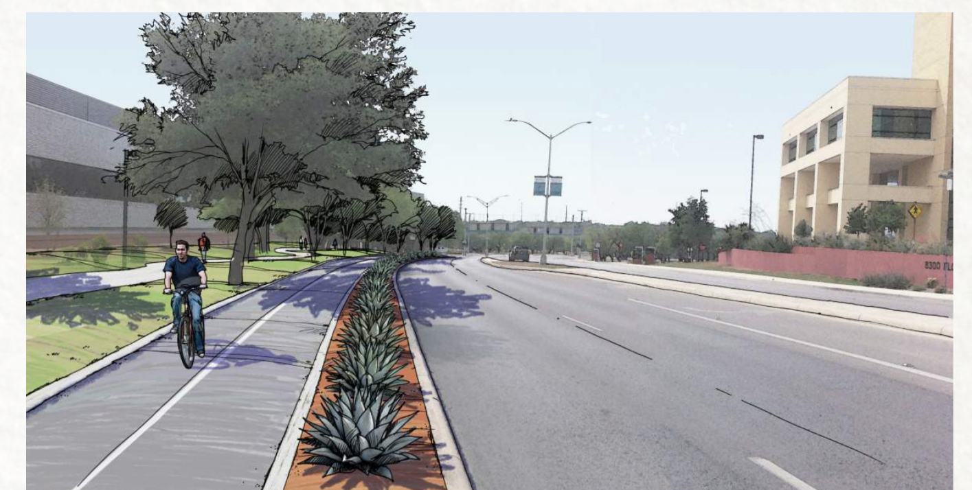
GREEN STREET AFTER