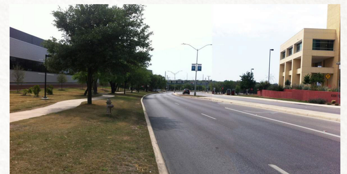
GREEN STREET BEFORE

As the first of its kind in San Antonio, landscape compliments and enhanced protected pedestrian and bicycle accommodations were incorporated into the street character for a hierarchy of connectivity through the Med Center Campus. With a green palette in mind and the encouragement of maintaining pedestrian circulation throughout, a respectable ownership is instilled upon existing and incoming investors to continue the "positive user experience".