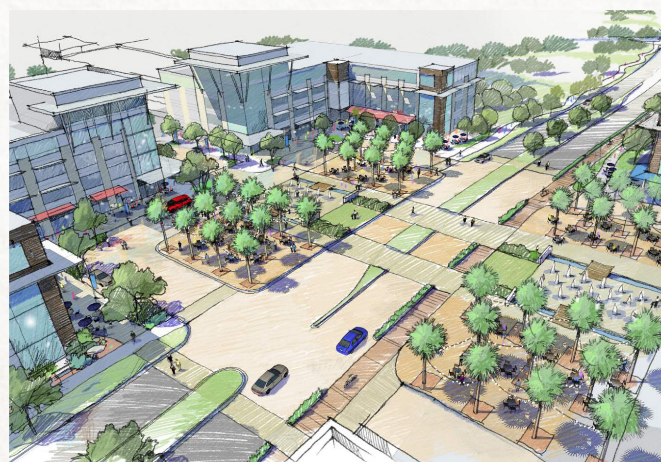
VIEW OF RESEARCH HUB PARK

The MCA and its campus take on an intense amount of activities with diverse support activities throughout the medical hub. With the support of campus institutions, the City of San Antonio, and the MCA, they designed to serve with intention to keep people they serve in mind first. The Med Center Green Street is an established and growing environment that highly recognizes that contribution of a healthy and safe community. A pathway of prioritizing the core and capital opportunities to accommodate a transforming environment.