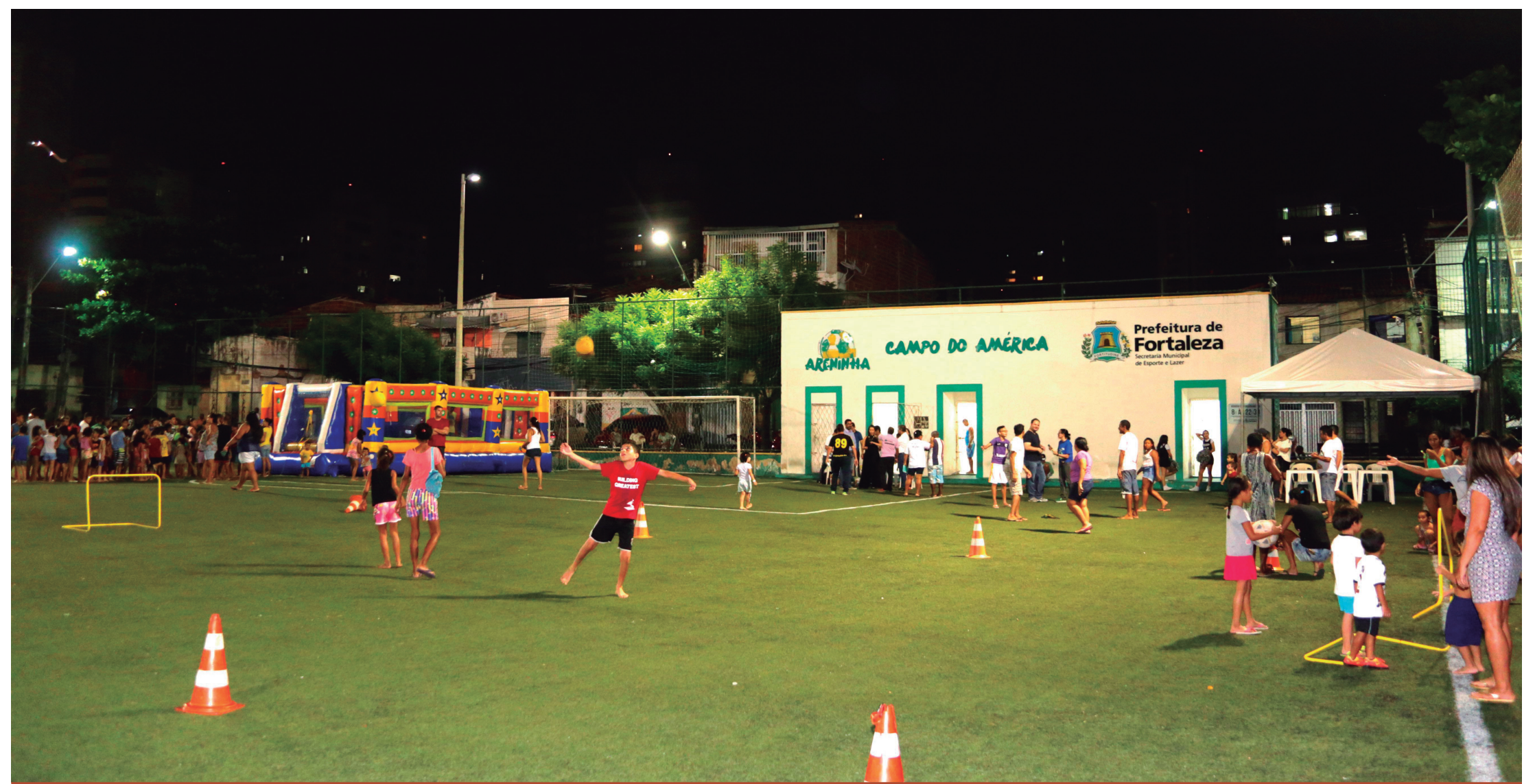
Fortaleza City Hall Official Website, 3 Years Anniversary of Campo do América Areninha, 2017.

The goal is to deliver quality sports equipment to the population, especially to benefit the children's experience with public places, where the community can besides practicing physical activity, have a safe space for living, leisure and citizen training. There are 23 Areninhas and 05 mini Areninhas in Fortaleza.