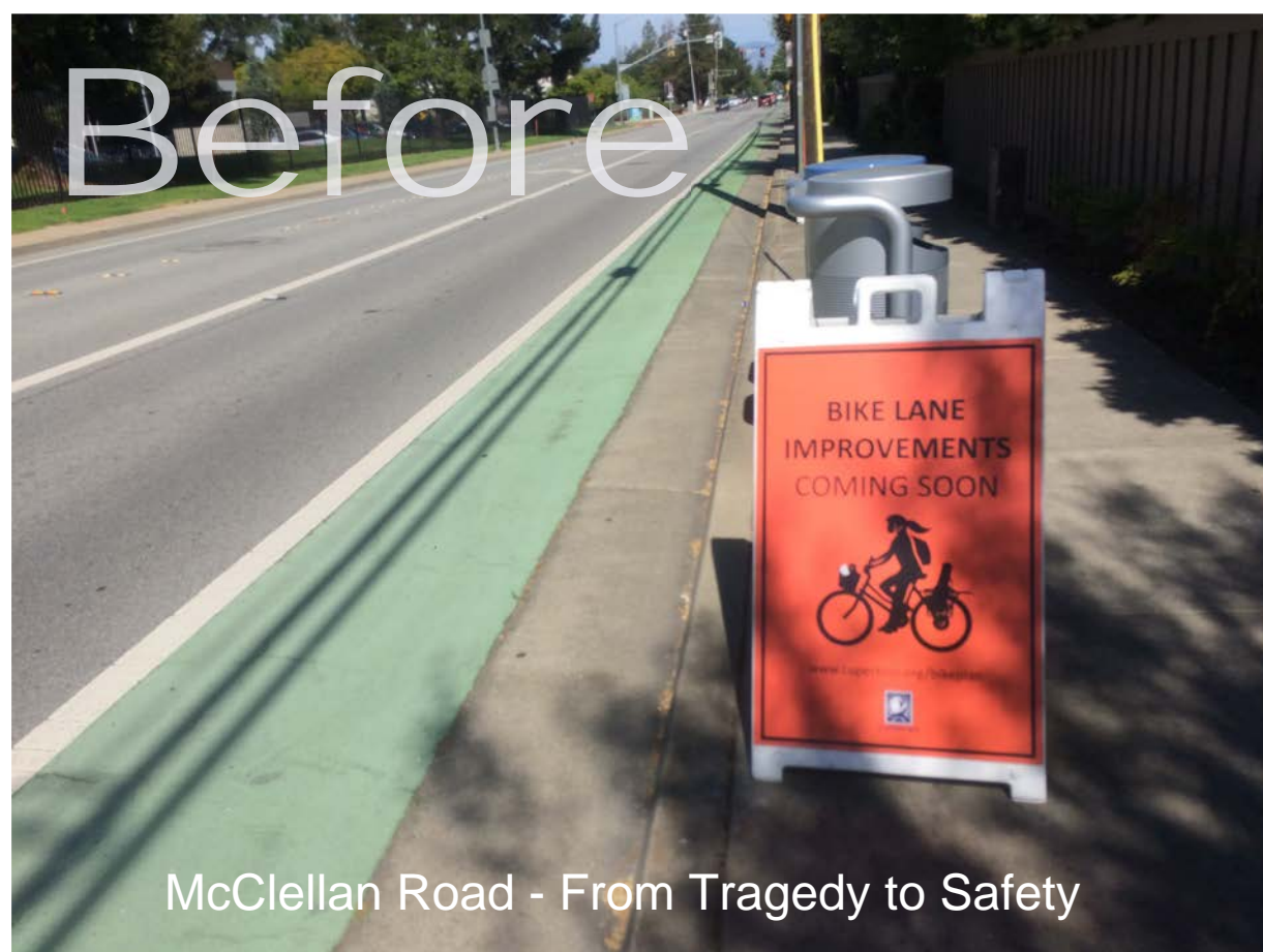
McClellan Road - From Tragedy to Safety

Death of student cyclist in 2014 led to widespread support of bicycle + pedestrian school safety programs & projects.