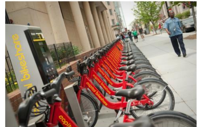
Capital Bikeshare has 3,000 bicycles at 348 stations across the D.C. area. The bikeshare program is raising its prices for the first time since it launched in 2010.

Starting this spring, it will cost more to join the region's popular bike sharing network.