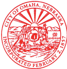
City of Omaha Jim Suttle, Mayor

Office of the Mayor 1819 Farnam Street, Suite 300 Omaha, Nebraska 68183-0300 (402) 444-5000 FAX: (402) 444-6059