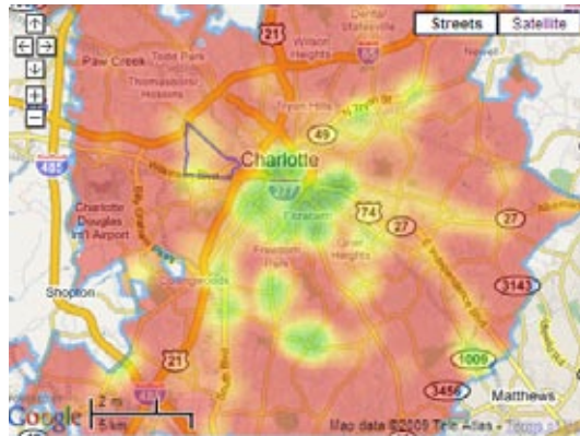
Ashley Park (Average Walkscore 54)