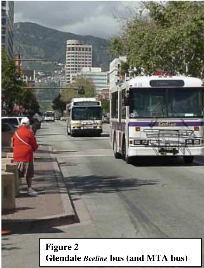
Figure 2 Glendale Beeline bus (and MTA bus)

In addition, the City of Glendale Fire Department has long been seeking a traffic signal preemption system for its emergency response fleet. With the continued increase in daily traffic, the response time required by emergency vehicles to navigate through city streets is degrading. During peak periods, with vehicles queuing at signalized intersections, the raised medians on major thoroughfares restrict the ability of emergency responders to cross over into traffic lanes in the opposite direction, which may be unoccupied. A traffic signal preemption system will reduce Code 3 (“lights and siren”) response times by providing the appropriate green signals along an emergency response route. Other well-known advantages of a preemption system are increased traffic safety by eliminating the need for emergency vehicles to enter signalized intersections during a red signal, and the reduction of wear and tear on emergency vehicles through a reduction in “stop and go” driving. Since both transit priority and emergency vehicle preemption involve granting extraordinary signal right-of-way to an eligible vehicle, the City believed it would be logical and cost effective to deploy one common system that has the capability to handle both functions. The LACMTA grant was augmented with Glendale Fire Department Capital Improvement Program funding to expand the system concept to cover both functions.