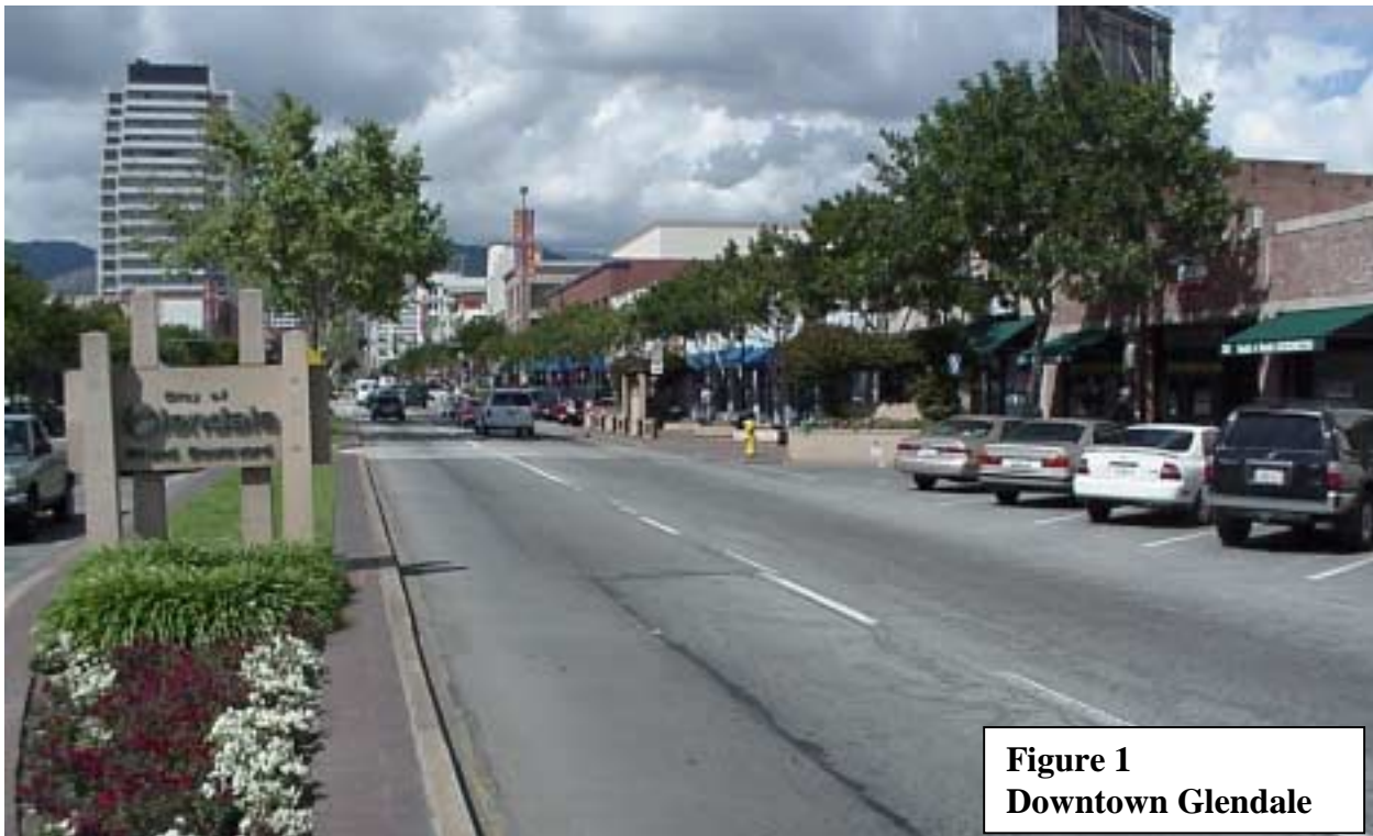
Figure 1 Downtown Glendale

Glendale, the third most populous (200,000) city in Los Angeles County, is located seven miles northwest of downtown Los Angeles in the foothills of the San Gabriel Mountains. Glendale is situated among four major freeways providing direct and convenient access to the Los Angeles metropolitan area. There are approximately 220 signalized intersections in the City, most of