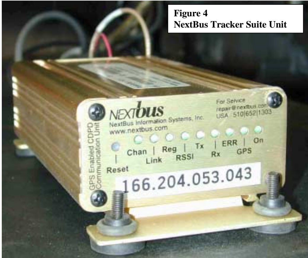
Figure 4 NextBus Tracker Suite Unit