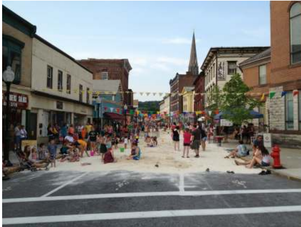
North Adams, MA