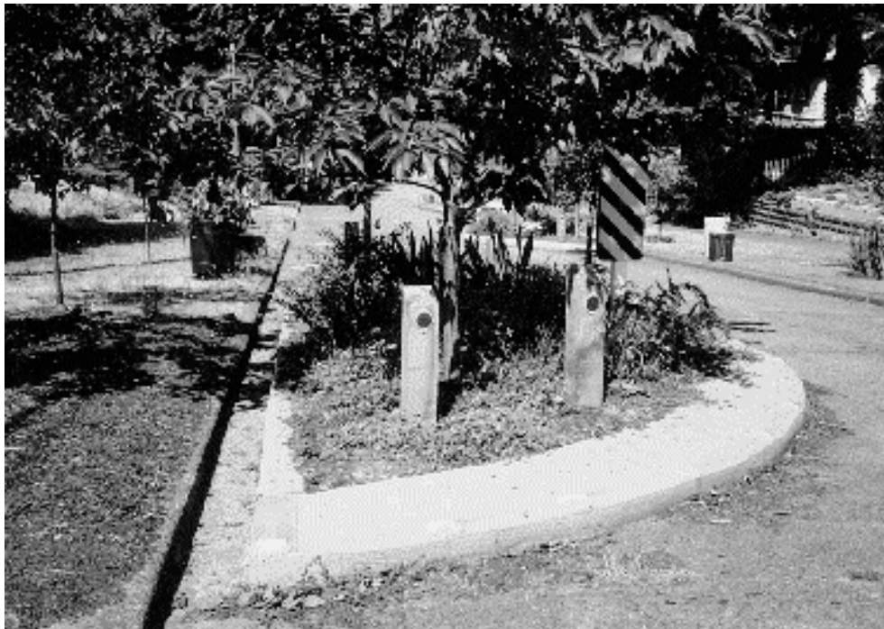
Figure 5. Two Foot Mountable Curb

As a result of the input from the fire department, future chicanes were constructed with 2 foot wide mountable curbing,(figure 5) to allow emergency vehicles to drive over the curb more easily if needed. In addition, parking is not allowed inside the chicanes. All chicanes are run by the fire department, and to date, they have not expressed concern on other locations.