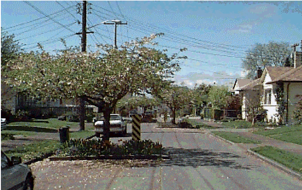
Figure 1. Chicanes on NE 70 th Street

In 1984, two sets of chicanes were installed. Each set consisted of three curb bulbs extending approximately 13 feet into the street (figure 1). The bulbs were spaced 50' to 80' apart, with the two sets of chicanes located 420 feet apart.