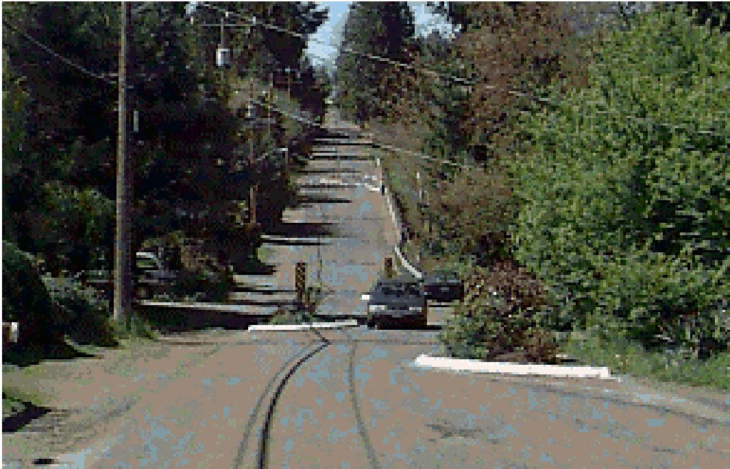
Figure 2. Chicanes on NE 98 th Street